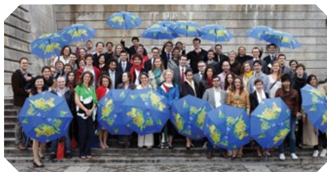
Fellows at 2012 Fox Fellowship reunion in Paris, France

It is an imperative to maximize the range and caliber of academic advances made possible through the exchanges by expanding the Fellowship to a more diverse group of scholars. One major way of accomplishing this is to open the program up to new countries. In 2015, the Fox Fellowship announced partnerships with universities in Singapore, Canada, Australia, and Denmark.