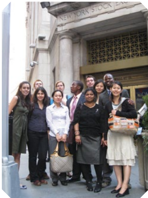
Fellows at New York Stock Exchange